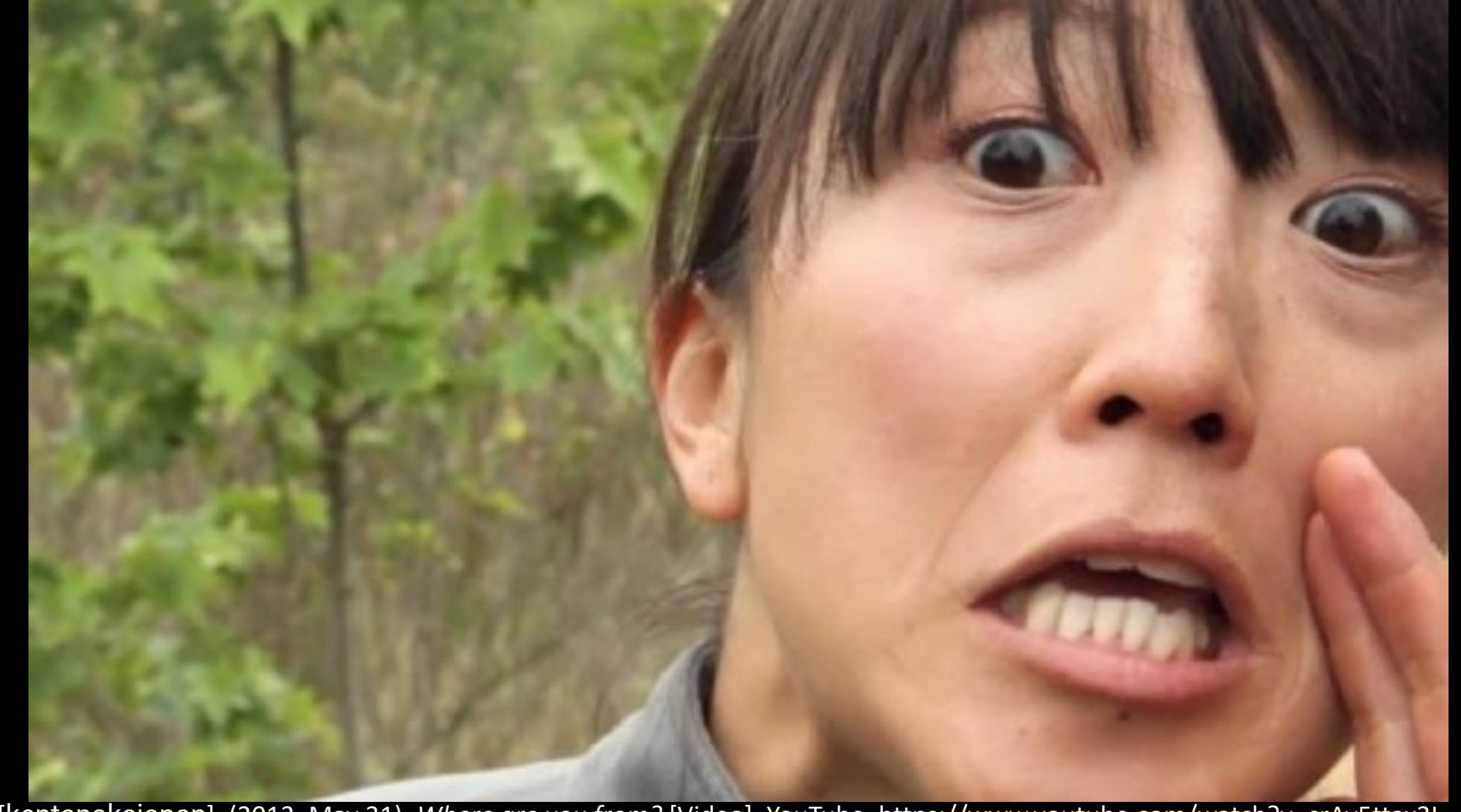
[kentanakajapan]. (2013, May 31). Where are you from? [Video]. YouTube. https://www.youtube.com/watch?v=crAv5ttax2I